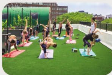
OPEN GYM/YOGA AREA