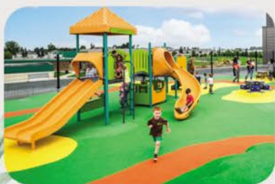
MULTIPURPOSE PLAY UNIT